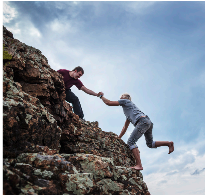
Highly trained team members as a foundation for efficient, powerful and stable software.

Our training process consists of three steps. Training takes the form of a carefully balanced combination of theory and practical exercises – ideal for establishing a solid knowledge base. When your team members return to project work, they have chance to implement what they’ve learned and will begin to encounter their first issues. In order that participants are able to gain maximum benefit from the trainer’s experience, a subsequent workshop will be held to review these issues: participants will have chance to discuss the challenges of their application on a 1:1 basis and to draw up potential solutions. Beyond this, you can set up your team for maximum success by using our coaching service during your initial phase. This ensures that inevitable barriers are successfully managed and guarantees the successful rollout of your chosen technology.